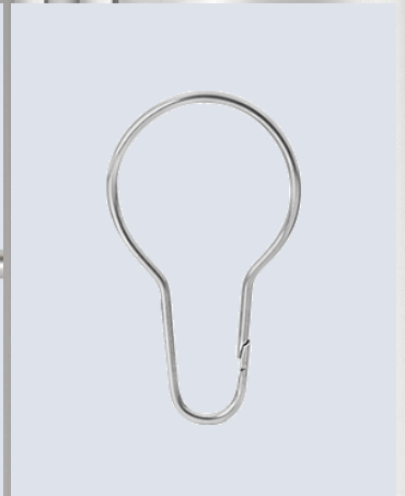
Stainless Steel Rings