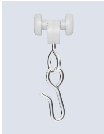
Stainless Steel Carriers