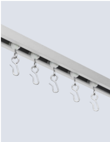
Aluminum Curtain Track