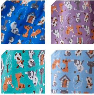
Available design patterns