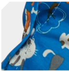
Pajamas and plastic snap IV sleeves