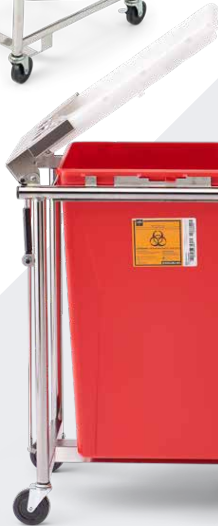
MDS705218 and MDS705218CART See page 9