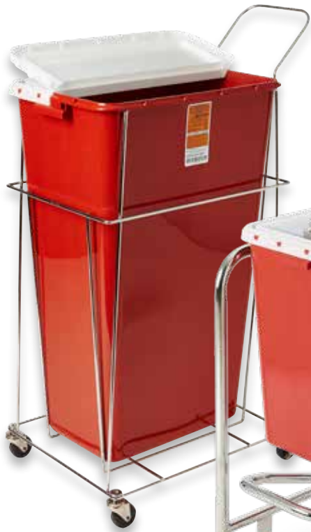
MDS705218HN and MDS707CART See page 7