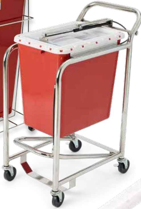
MDS705212SL and MDSSSLIDECART See page 7