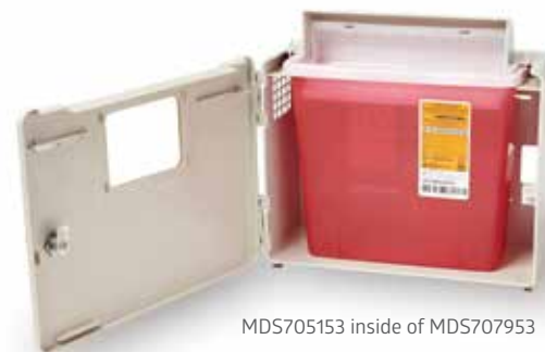
MDS705153 inside of MDS707953