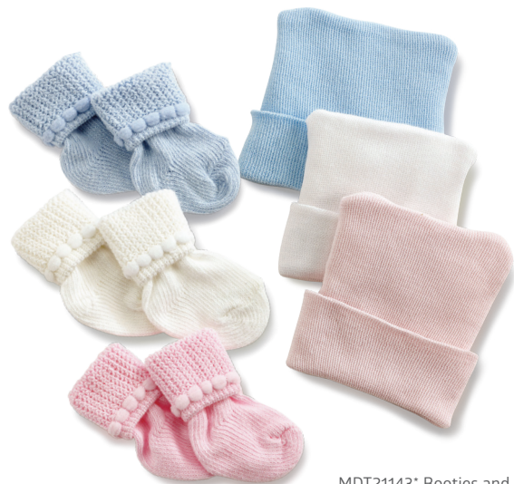
MDT21143* Booties and Sets