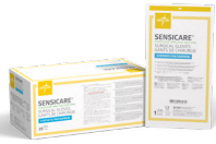
SensiCare PI with Aloe