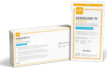
SensiCare PI Shield**