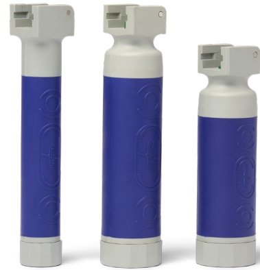
MDS0170249 MDS0170250 MDS0170251