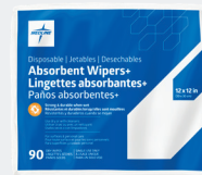
Perforated pack (AWP0500)