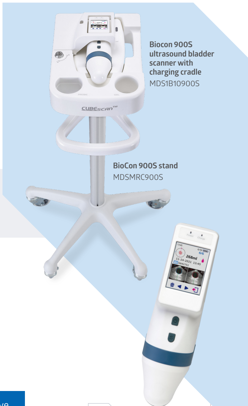
Biocon 900S ultrasound bladder scanner with charging cradle MDS1B10900S